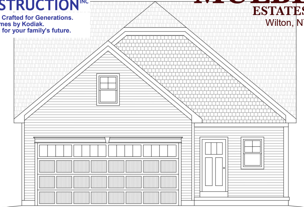
Optional Features Shown