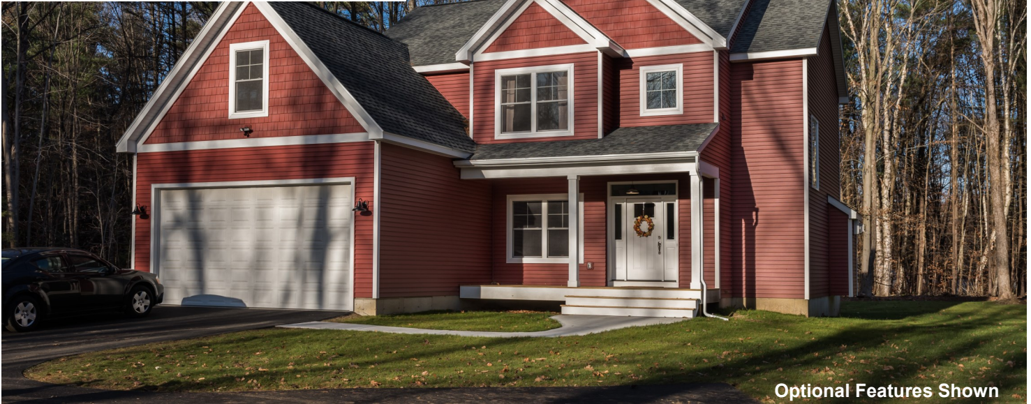
Optional Features Shown