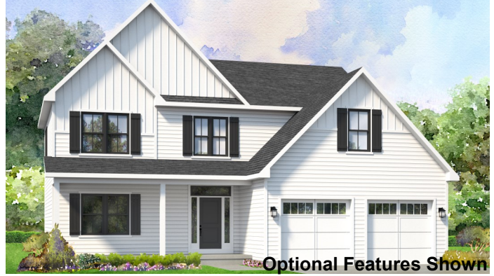
Optional Features Shown

Built for you. Crafted for Generations. Homes by Kodiak. Constructed for your family's future.