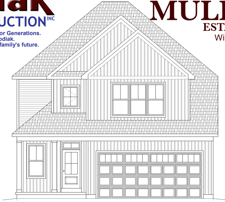
Optional Features Shown