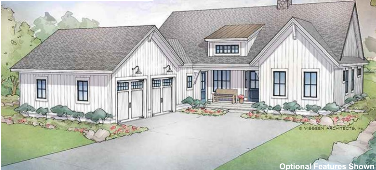
Optional Features Shown