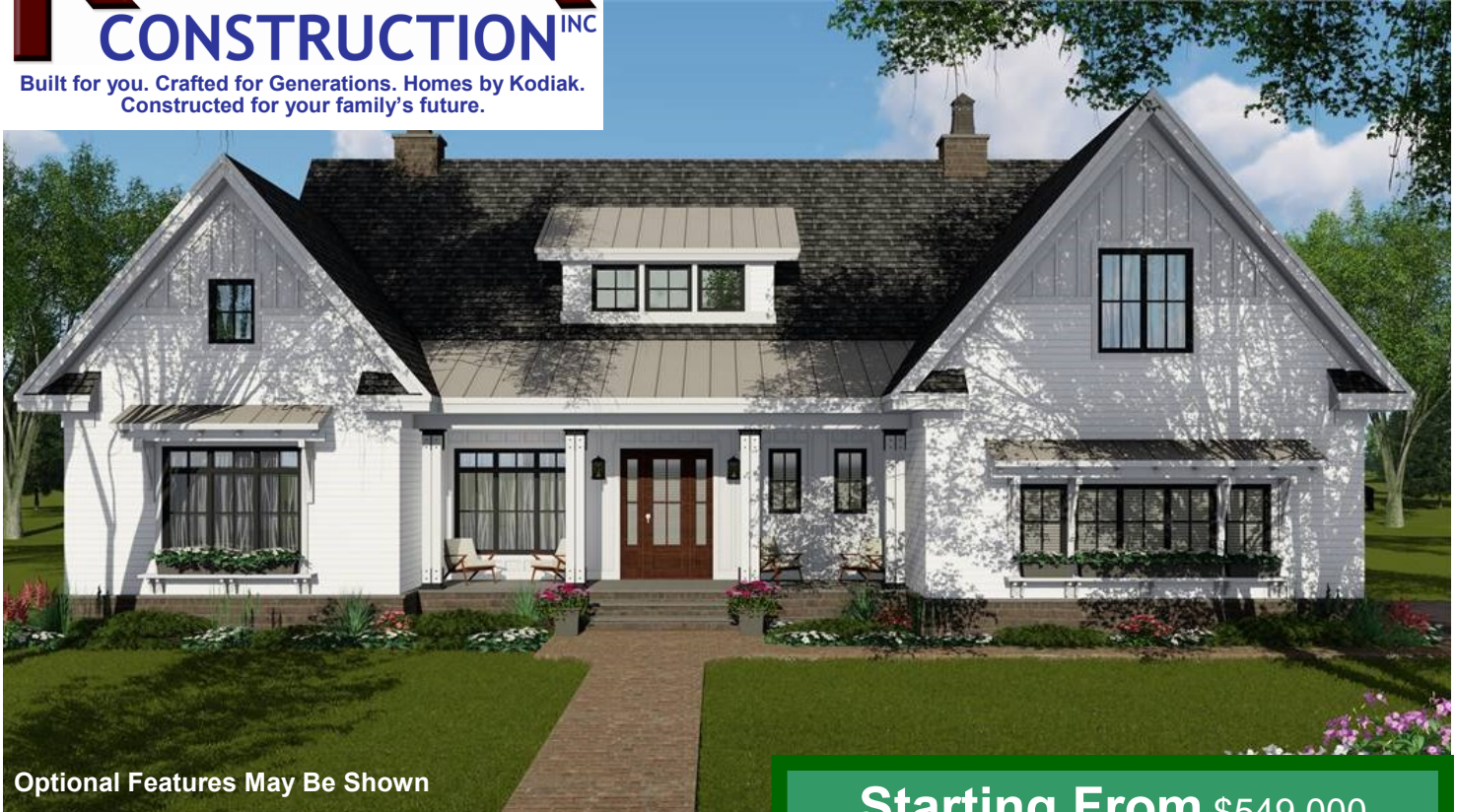
Optional Features May Be Shown